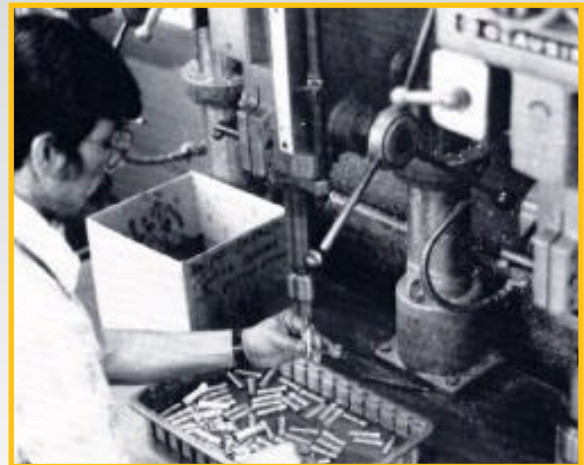
Operator begins final deburring operation on the inside diameter of the aluminum sleeve used in M-series compressed Air-driven pumps Manufactured at Haskel Inc.'s Burbank, CA facility.

smoothly and efficiently. After the preliminary deburring operation, the sleeves are taken to the Flex-Hone station. At this point, the operator places a pan of kerosene beneath the Flex-Hone and loads the pan with the sleeves, which become lubricated with the liquid. At the same time, he activates the drill motor, which rotates the hone at about 100 rpm. He then lifts a sleeve to the revolving hone and makes five or six passes.